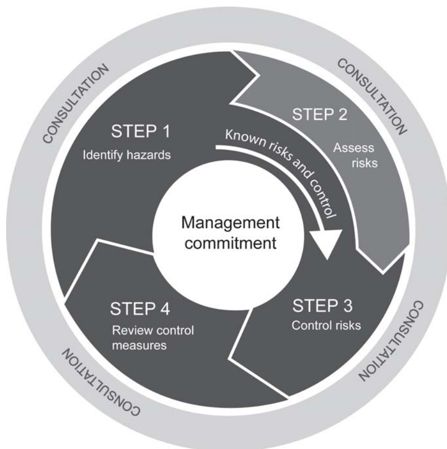
Figure 1: The risk management process

Many hazards and their associated risks are well known and have well established and accepted control measures. In these situations, the second step to formally assess the risk is unnecessary. If, after identifying a hazard, you already know the risk and how to control it effectively, you can just implement the controls.