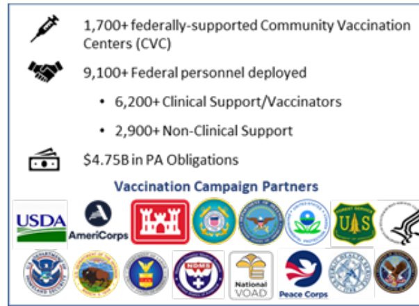
Figure 2. Federal Vaccination Campaign Support as of April 30, 2021

When SLTT partners are overwhelmed, FEMA is prepared and postured to provide the lifesaving, life-sustaining capabilities that have customarily been available from FEMA in support of states, tribal nations, and territories. FEMA will reprioritize resources as needed for emerging incidents while maintaining operational support to SLTT partners. After initial response, FEMA will continue to coordinate with SLTT partners to identify sustainable long-term staffing solutions, if necessary.