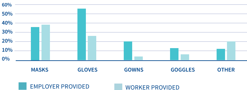
FIGURE 1. PERSONAL PROTECTIVE EQUIPMENT

Recommendation 5: Paid pandemic leave is available to all DSWs who do not have access to paid sick leave and need to self-isolate or quarantine while waiting for a test result; or because they have COVID-19; or are a contact of a known case. This should be paid regardless of their employment arrangement.